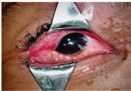
Image 1: Affected eye (Right) showing circumcorneal congestion, chemosis, corneal edema